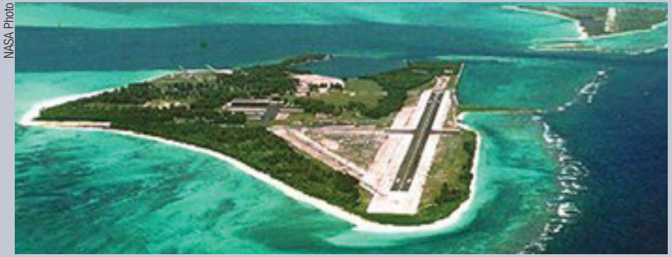
In January, DLA Energy made a one-time fuel delivery to the remote Midway Islands in support of the Coast Guard. The islands, located in the Pacific Ocean, are 1,300 miles from the nearest source of fuel, making delivery challenging.

“Until EBS came along, we had no standardized, automated mechanism to recover costs, so EBS is the key to successfully rolling out this program,” he said. “Now we have a more robust supply chain management system, and it gives us the ability to track the contract performance and sales and assess or optimize the supply chains that lead to improvements in many areas from execution to oversight. We can see what the customer is doing and how much they’re